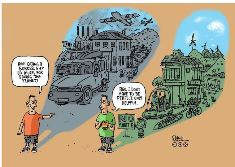
© Slane Cartoons Limited: "Carbon Shadows" (CC 4.0)